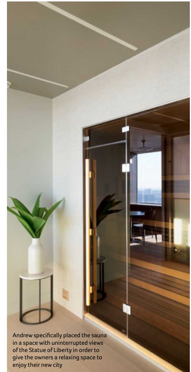
Andrew specifically placed the sauna in a space with uninterrupted views of the Statue of Liberty in order to give the owners a relaxing space to enjoy their new city

you very quickly forget where you are. A long, horizontal foyer that leads to a wall of running water creates serenity and calm. After you manage to peel your eyes from the trickling streams, you notice the abundance of natural light and the beauty of an inaudible city that envelops the home's interior. As the sky, sun and land are such a big part of this residence, Andrew wanted to highlight these natural elements through complementary interior fixtures and fittings. "Greys, muted timbers, high-gloss doors, weighty door handles and plumbing fixtures create the calm, masculine elegance the client was looking for," says Andrew. Key design elements creating this interior atmosphere included the custom matt-finish, rift-cut, white oak flooring; Bluworld custom water wall; Poggenpohl cabinetry; Dornbracht Elio kitchen faucet and Ecosmart ethanol burner surrounded by silver travertine stone from Artistic Tile.